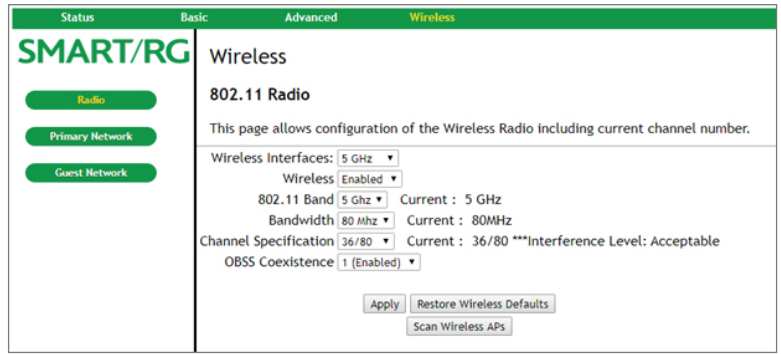
* The primary differences between the 2.4 GHz and 5GHz wireless frequencies are range and bandwidth. 5GHz provides faster data rates at a shorter distance. 2.4GHz offers coverage for farther distances, but may perform at slower speeds.

To enable or disable a frequency, select 5 GHz or 2.4 GHz from the Wireless Interfaces drop down menu. Then, select if you would like it Enabled or Disabled from the Wireless drop down menu.